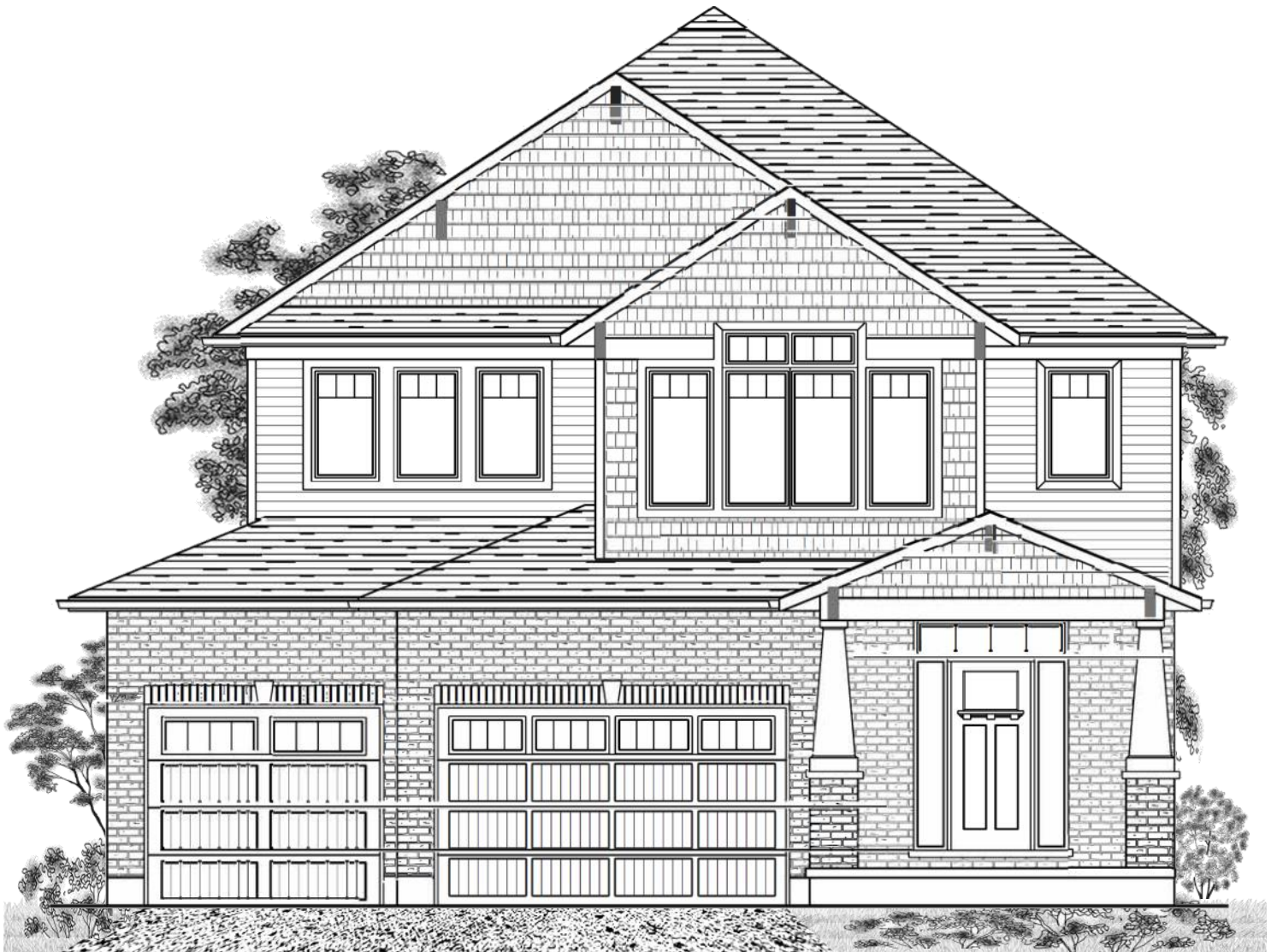
Standard Brick Elevation