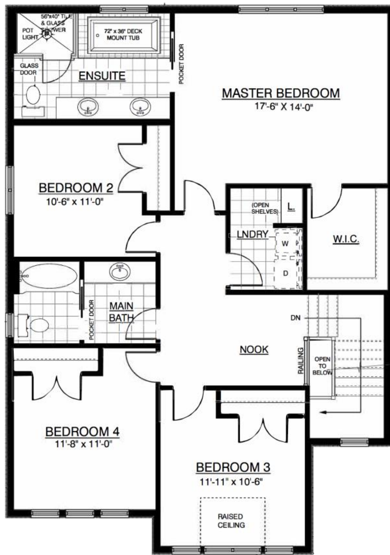
Upper Floor Plan - 1,265 sqft